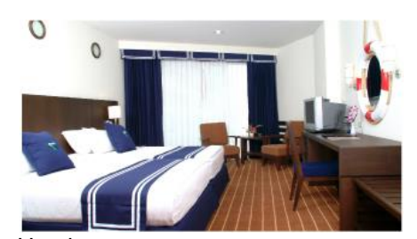
Rooms in the Hotel

Accreditation: The accreditation was carried out on 07.10.2016, started at 13:00 hrs. at Hotel lobby of the new wing. Only accreditation cards were given out on arrival, training and meetings information were on the information board at the hotel information desk and also through Liaison person of each team. A bag was distributed as souvenir to all